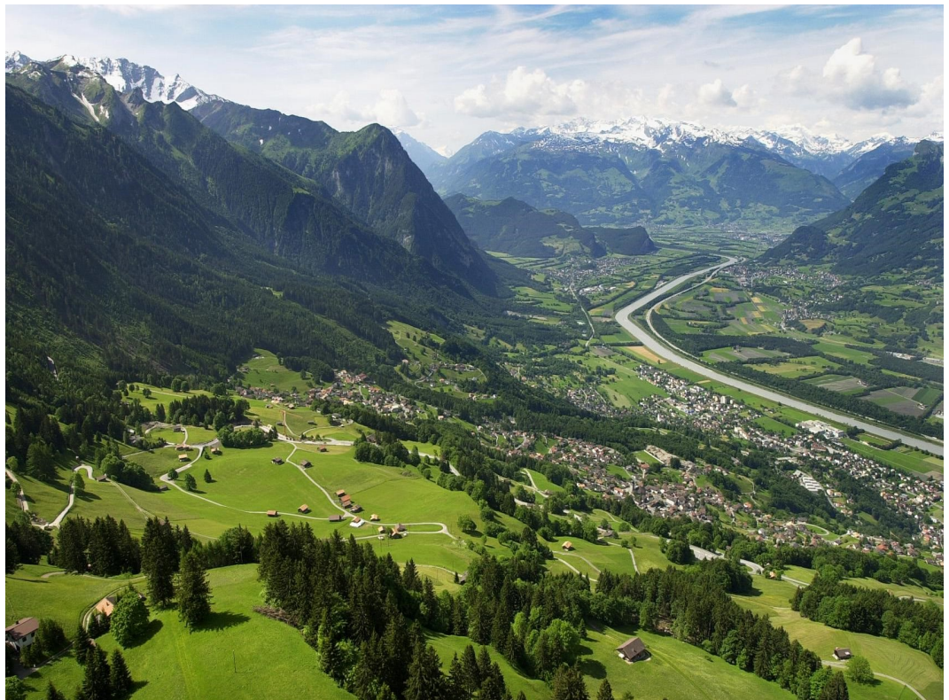
View of the Valley with the Rhine taken from Liechtenstein. Switzerland is across the river.