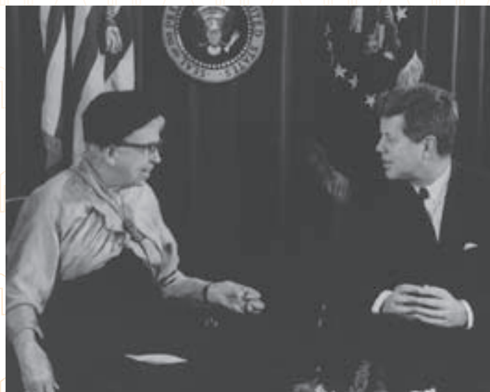
Eleanor in the Oval Office with President John F. Kennedy at the meeting of the President's Committee on the Status of Women. (Washington D.C., December 1962)

The Universal Declaration of Human Rights serves as the cornerstone of the modern human rights movement. Since its adoption by the United Nations in 1948, the Commission on Human Rights has converted its principles into legally binding conventions, such as the UN conventions on civil and political rights, social and economic rights, and torture. Its principles