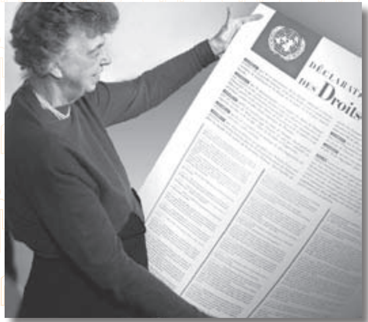
Universal Declaration of Human Rights, (November 1949)