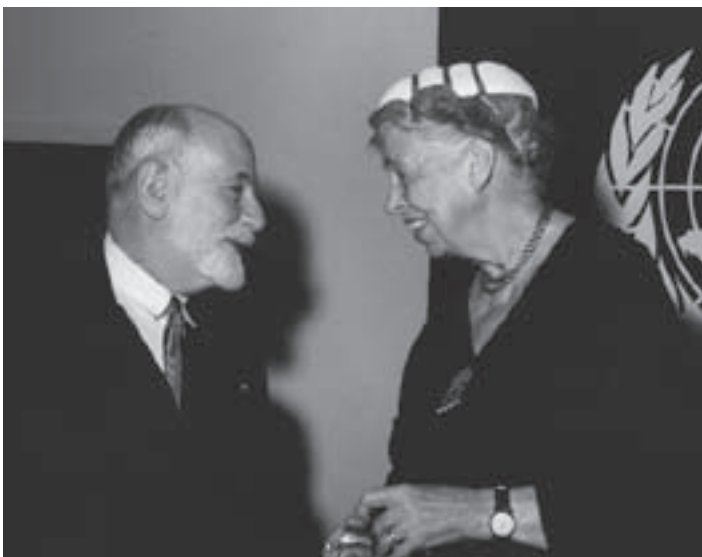
Eleanor with René Cassin at the U.N. (N.Y., April 1958)

In December the Commission on Human Rights met in Geneva, the city that would later become the home of the UN human rights program. Although both the United States and the Soviet Union argued that the Commission should complete a declaration of human rights before it tried to draft a covenant (a document that, unlike a declaration, would become legally binding on the nations that ratified it), the majority voted to separate into three groups in order to work simultaneously on a declaration, a covenant, and methods of implementation. The groups would then report back to the full commission. ER chaired the working group that reviewed the drafting committee’s version of the Declaration and prepared revisions to recommend to the full commission. This working group also included René Cassin of France, Carlos Romulo of the Philippines, and Aleksandr Bogomolov, Soviet ambassador to France. When the full commission reconvened, ER often kept them at work from early in the morning until after midnight. “I drove them hard,” she wrote to a friend after the commission adjourned, “but they are glad now it’s over and all the men are proud of their accomplishment.”