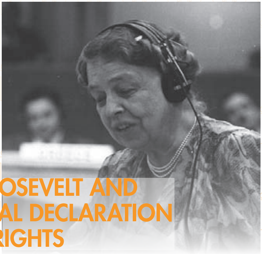
Eleanor at the U.N. (July 1947)

T he United Nations General Assembly adopted the Universal Declaration of Human Rights on December 10, 1948 in the midst of an especially bitter phase of the Cold War. Many people contributed to this remarkable achievement, but most observers believe that the UN Commission on Human Rights, which drafted the Declaration, would not have succeeded in reaching agreement without the leadership of the Commission's chair: Eleanor Roosevelt. ER herself regarded her role in drafting and securing adoption of the Declaration as her greatest achievement. As she readily admitted, she had no legal training or expert knowledge of parliamentary procedure, but she brought to her job as chair the skills she had acquired as political activist, reformer, and advocate for those excluded from power and an understanding of the meaning of freedom earned through a deep engagement in the struggle in her own country for social and economic justice, civil rights, and women's rights. She possessed not only a passionate commitment to human rights, but a hard-earned knowledge of the political and cultural obstacles to securing them in a divided world.