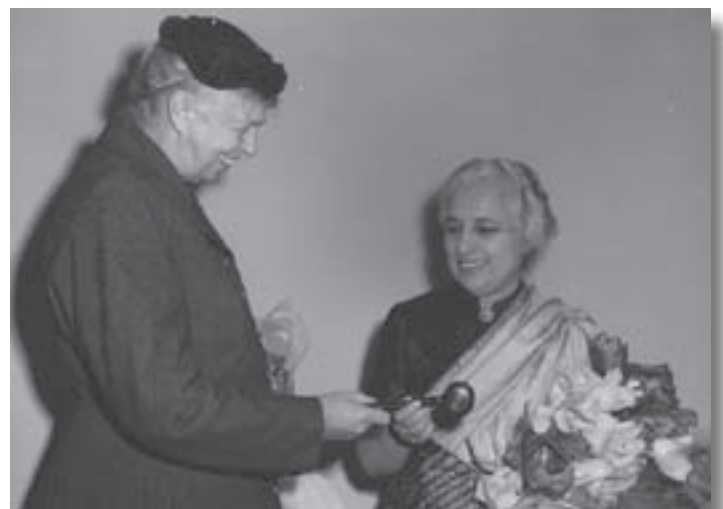
Eleanor presenting a gavel to Mrs. Vijaya Lakshmi Pandit, President of the General Assembly, on U.N. day (October 1953)

“Courage is more exhilarating than fear and in the long run it is easier.”