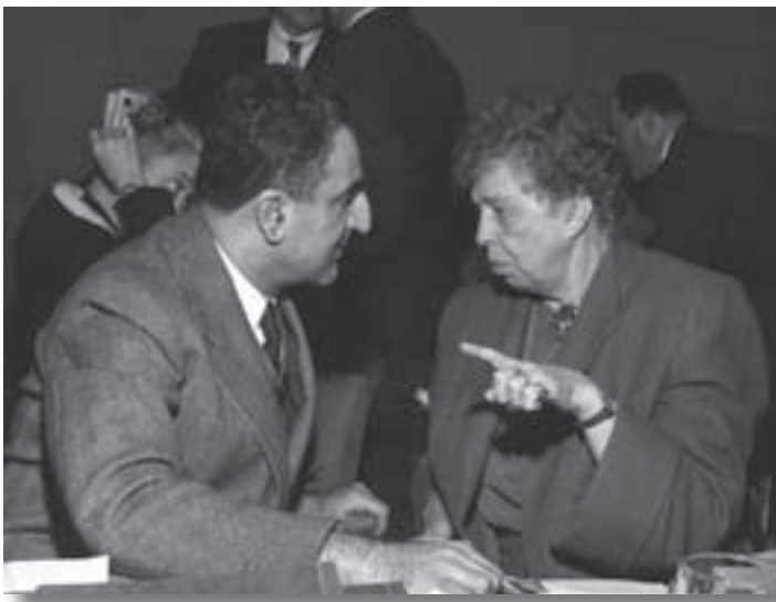
Eleanor and Charles Malik at the U.N. (November 1950)

“Staying aloof is not a solution. It is a cowardly evasion.”