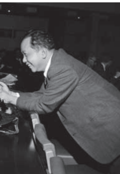
Eleanor chats with General Carlos P. Romulo, chairman of the Philippines delegation (N.Y., November 1947)

When the commission met for the first time on April 29, 1946, it unanimously elected Eleanor Roosevelt (ER) chair.