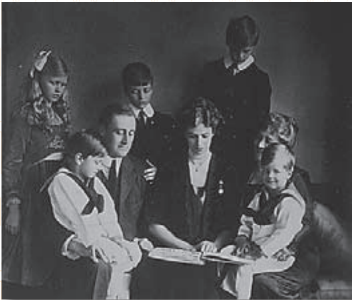
Eleanor, Franklin Roosevelt and family (Washington D.C., June 1919)

“All human beings are born free and equal in dignity and rights. They are endowed with reason and conscience and should act towards one another in a spirit of brotherhood.”