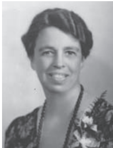
Eleanor at the home of Franklin K. Lane (Los Angeles, June 1933)